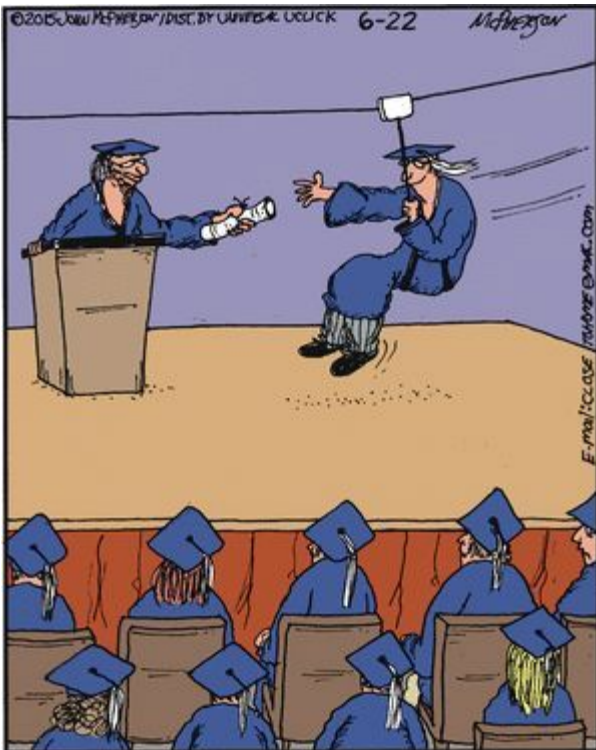
With over 800 students in the senior class, Ferdstein High installed a zip line to speed up the graduation process.